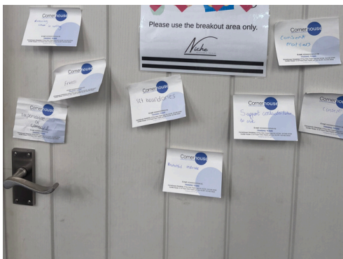
Learner feedback from the event at Niche.

Thanks to Niche and Goodwin for hosting!