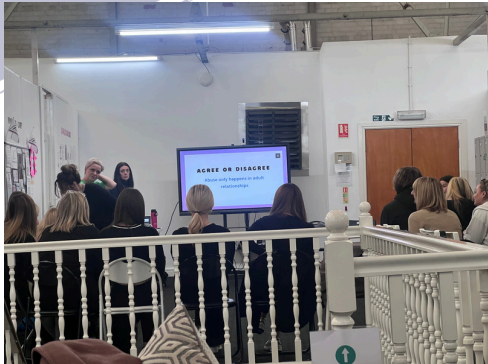
CornerHouse event at Niche.

Their powerful presentation highlighted the real-life impact of violence and encouraged learners to think carefully about their actions and choices.