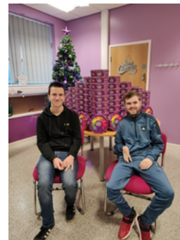
Photo shows participants from the This-Ability project with their Christmas hampers.

In December, Nestle in York kindly donated 80 Quality Street tubs for This-Ability learners based in Hull and the East Riding. Each year the This-Ability staff make Christmas hampers and deliver them to learners, for them and their families to enjoy over the festive period. Last year was the last time as sadly the project came to an end in December 2023, so the staff, with help from the big donation made from Nestle, made an extra special effort and gave all learners a large hamper full of goodies.